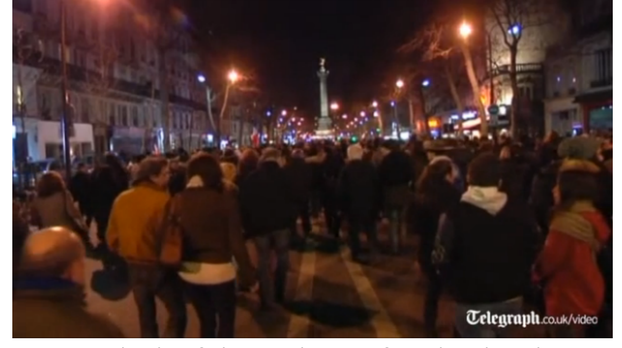
Watch video of silent march in Paris from The Telegraph

Several thousand people staged a silent march in Paris in memory of the victims of the Monday attack in Toulouse, where a gunman on a motorbike shot dead three children and a teacher at a Jewish school. People marched holding banners and waving flags. Some lit candles at the symbolic Bastille monument in Paris, according to the Telegraph .