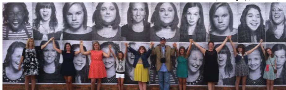
Photo Exhibit of Girls Who Were Bullied Speaking Up, Paducah, KY

For weeks, your child has been coming home from school and locking himself in his bedroom. His answers are mostly one word and are delivered in an angry tone. Most mornings he wakes up and says he has a stomachache and doesn't want to go to school. When you ask if anything is wrong, he says no. You notice his grades are starting to drop and his appetite is off. These are all signs that your child is possibly being bullied. Other signs that your child is a target may include: