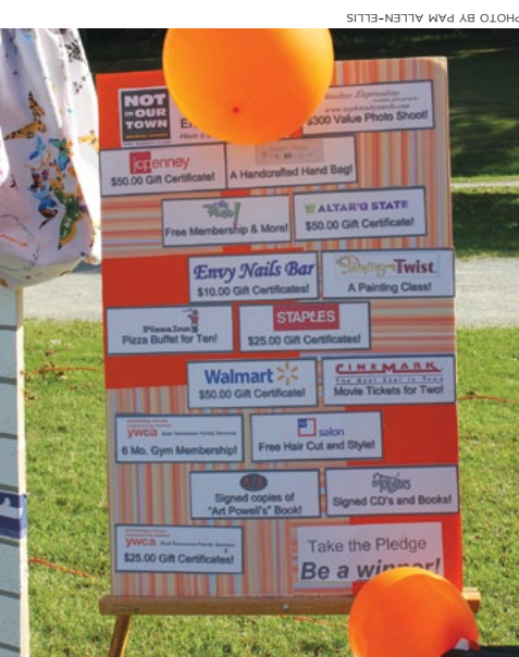
NIOT Oak Ridge sponsors