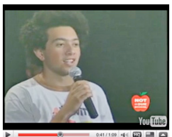
Students from Palo Alto spoke passionately about their experiences dealing with ethnic and anti-gay slurs and cyberbullying at last month's Not In Our Schools event at the Media Center.

Ready to be inspired? Check out the NIOT blog for two powerful Not In Our School video clips.