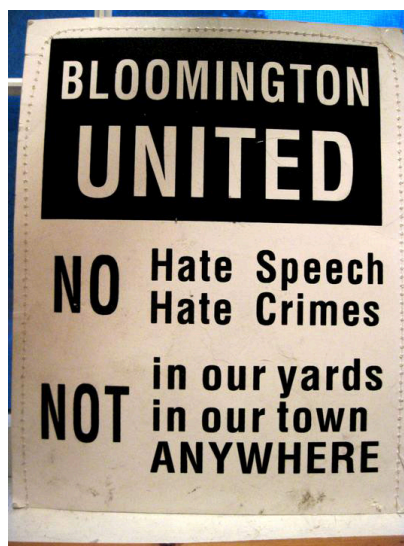
Sign that has stood in Bloomington yards since Bloomington United formed in 1999.

But people in the town were ready to take action. Read about how Bloomington responded here .