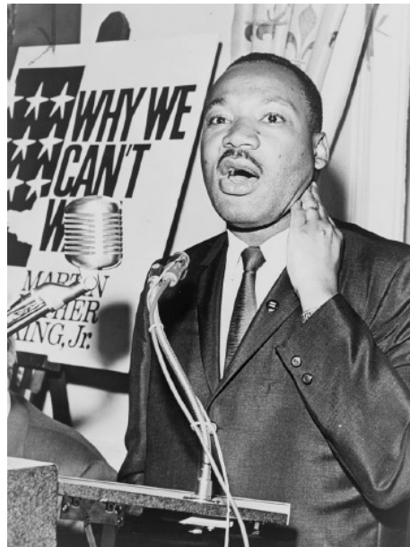
The Man with a Dream: Martin Luther King, Jr

Order today to get your copy in time for the federal holiday. The DVD contains four Not In Our Town short films highlighting communities living out Martin Luther King Jr.'s vision by responding with courage and positivity following a hate crime murder, cross burning, hate speech, and bullying. For more information, to preview one of the four films and to order, visit our MLK page .